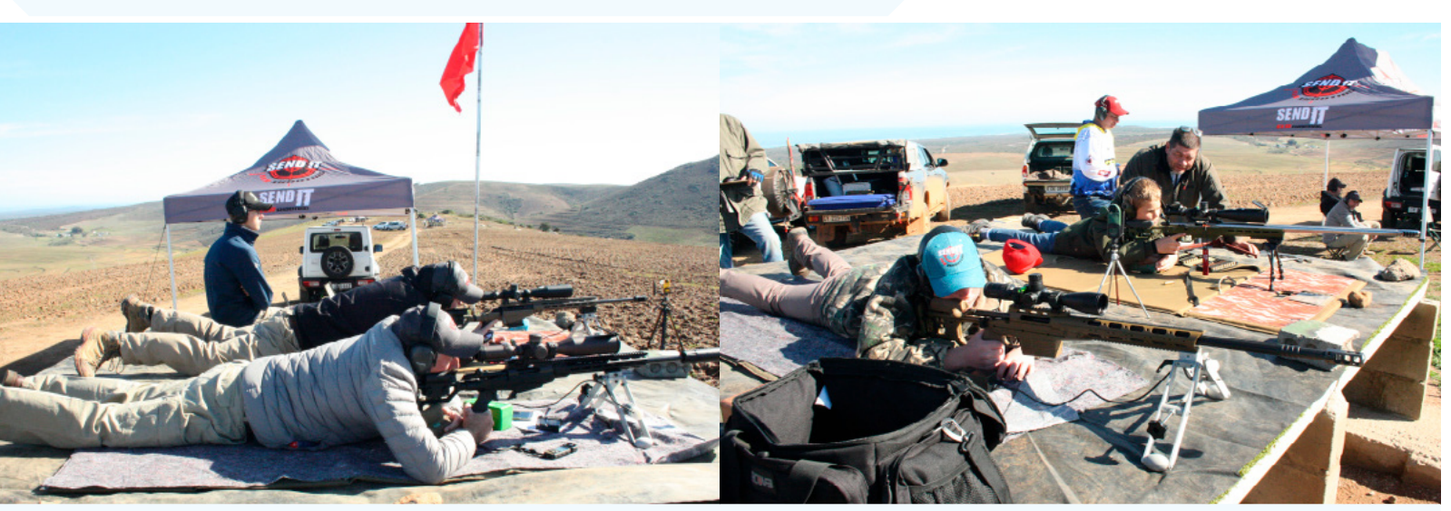
Shooters preparing to engage Range Number 2 - 3 targets set at 1395, 1539 and 1651 meters.