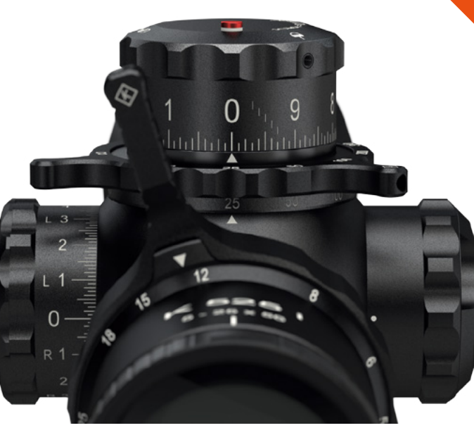
Extended field of view, easy to read clicks, throw lever and parallax spinner.