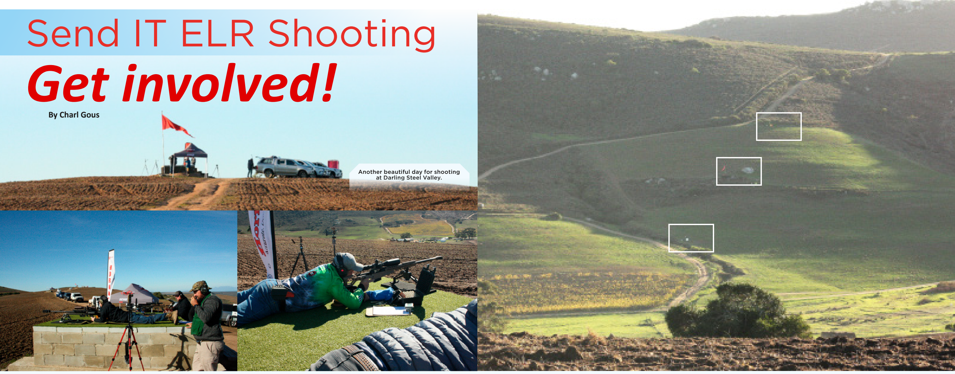
Gerhard Haasbroek preparing to take on Range Number 4 - targets set at 1538, 1690 and 1765 meters.